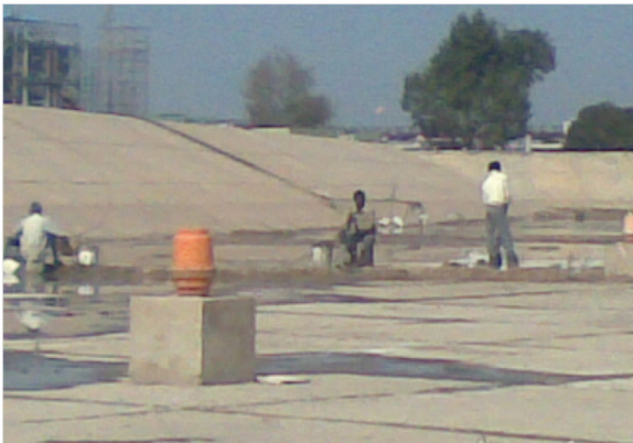
Repair work on the reservoir.