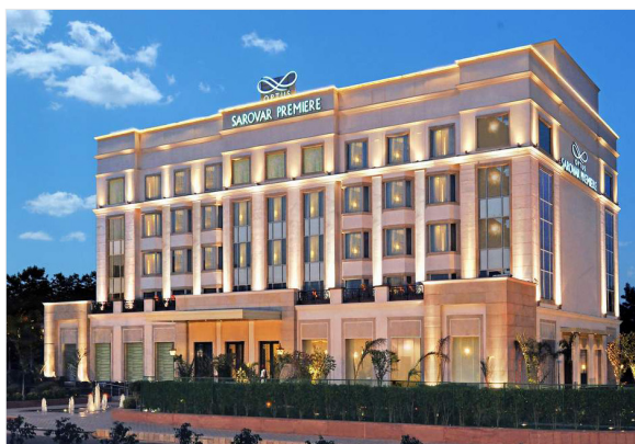
Exterior of the Optus Sarovar Hotel.

Learn more at kryton.com Krystol Internal Membrane™ (KIM®)